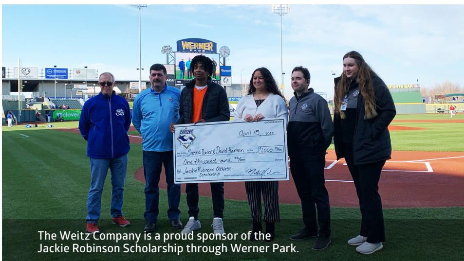
The Weitz Company is a proud sponsor of the Jackie Robinson Scholarship through Werner Park.